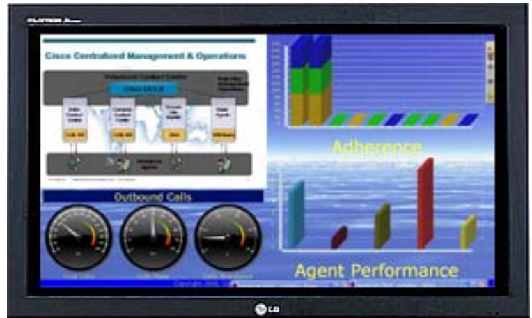
DashView HD puts Goal Achieving Metrics on LCDs or plasma displays for increased awareness by everyone.

AgentView® Enterprise is a cross-platform real time metrics system. It produces Goal Achieving Metrics™ which shape more profitable actions by your team in real time, making a positive impact now, not at the end of the week. Supervisors are out on the floor, not stuck at their desks. They are instantly connected to metrics with their Blackberry or other wireless devices and can act quickly, no matter where they are. Everyone who needs to be connected to performance is connected.